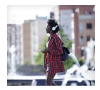
Find your fierce on your way.