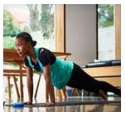
Find your fierce during TV time.