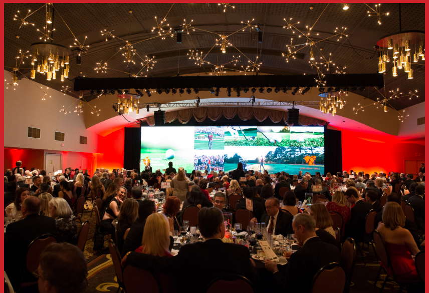
2018 St. Louis Heart Ball