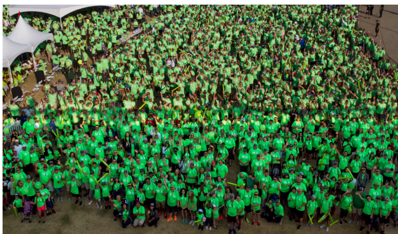
The Oncor Team at the 2017 Dallas Heart Walk

"It's rewarding to be a part of Heart Walk," he said.