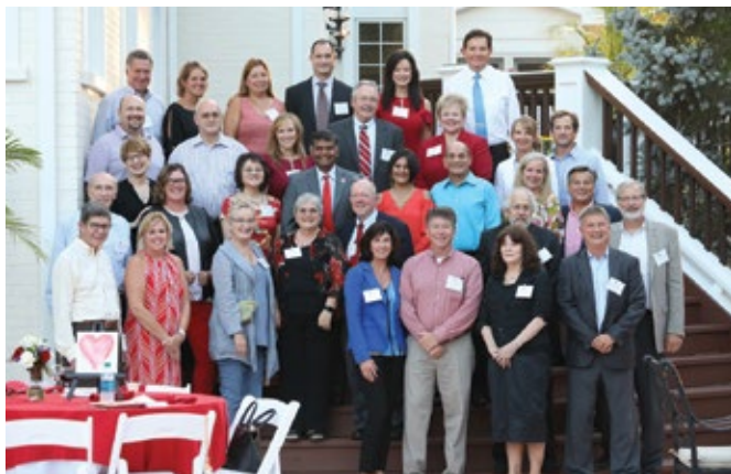
More than 30 Cor Vitae Society members and AHA volunteers gathered to hear about local AHA initiatives, including tobacco cessation, blood pressure reduction and healthy living.