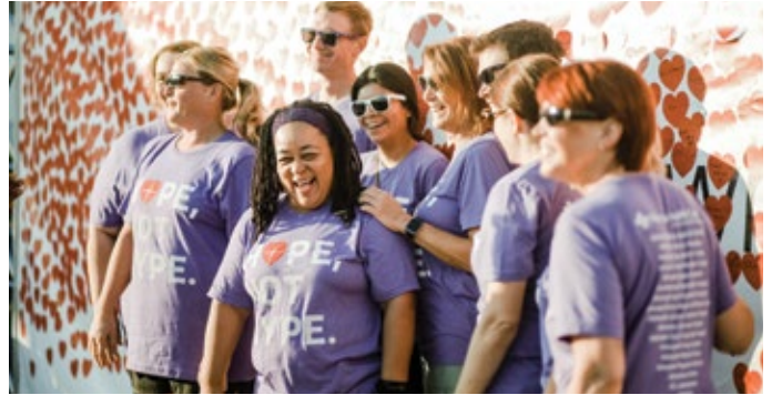
Chicago Heart Walk

Since those early days of the Heart Walk, the millions of dollars raised have helped many, including survivors of congenital heart disease, heart attack and stroke.