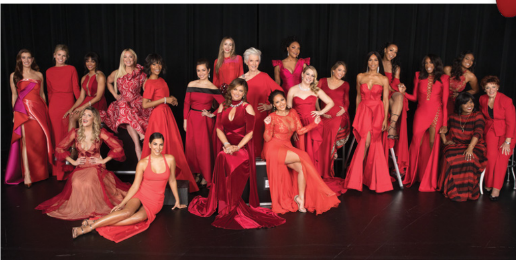
Celebrity models included: Niki Taylor, Marion Ross, Kathy Ireland, Maye Musk, Ginger Zee, Adrienne Bailon Houghton, CeCe Winans, Liz Hernandez, Elizabeth Rohm, Grace Helbig, Kate Walsh, Lynn Whitefield, Melissa Joan Hart, Rachel Lindsay, Tatyana Ali, and Zuri Hall.

The diversity of the celebrity models stretched from women in their 20s to their 80s and mirrored how cardiovascular disease strikes women of all ages and colors.