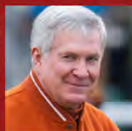
MACK BROWN 2016