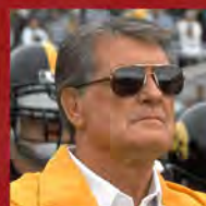
HAYDEN FRY 2012