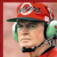
TOM OSBORNE 2008