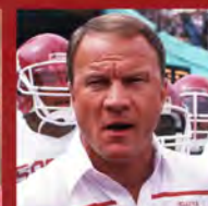
BARRY SWITZER 2009