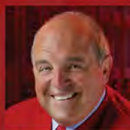
BARRY ALVAREZ 2017