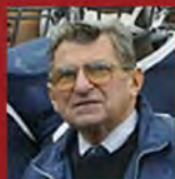
JOE PATERNO 1986 PENN STATE

While a national Coach of the Year Award has been an annual tradition since 1957, the American Heart Association adopted and re-named this award in 1986 to honor Paul "Bear" Bryant and to recognize coaches who have achieved excellence on and off the college football field.