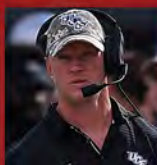
SCOTT FROST 2017 UCF