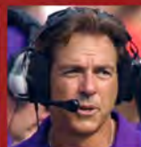
NICK SABAN 2003 LSU