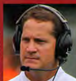
GENE CHIZIK 2010 AUBURN