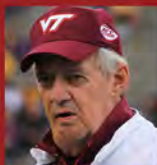
FRANK BEAMER 1999 VIRGINIA TECH