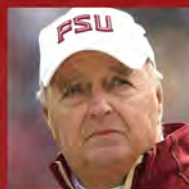
BOBBY BOWDEN 2011