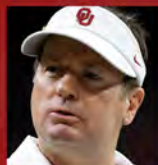
BOB STOOPS 2000 OKLAHOMA