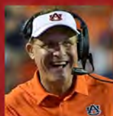
GUS MALZAHN 2013 AUBURN