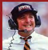
TERRY BOWDEN 1993 AUBURN