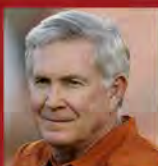
MAC K BROWN 2005 TEXAS