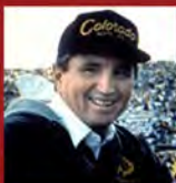
BILL MCCARTNEY 1989 COLORADO