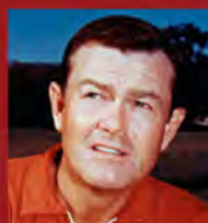
DARRELL ROYAL 2000