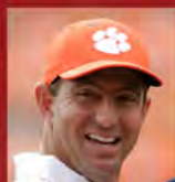
DABO SWINNEY 2018 CLEMSON