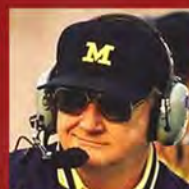
GLENN BO SCHEMBECHLER 2007