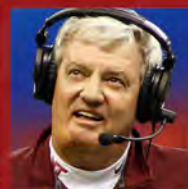
FRANK BEAMER 2019