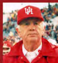
BILL YEOMAN 2002