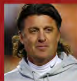
MIKE GUNDY 2011 OKLAHOMA STATE