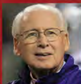
BILL SNYDER 1998 KANSAS STATE