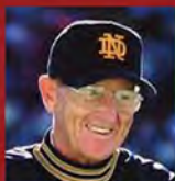
LOU HOLTZ 1988 NOTRE DAME