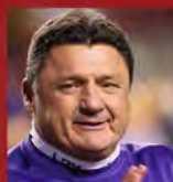
ED ORGERON 2019 LSU