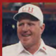
JACK PARDEE 2006