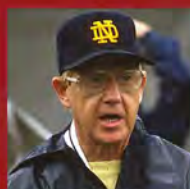
LOU HOLTZ 2005