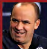
BILL O'BRIEN 2012 PENN STATE