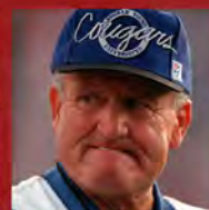
LAVELL EDWARDS 2013