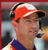
DABO SWINNEY 2016 CLEMSON