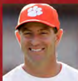
DABO SWINNEY 2015 CLEMSON