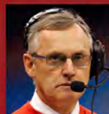
JIM TRESSEL 2002 OHIO STATE