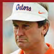
STEVE SPURRIER 2018