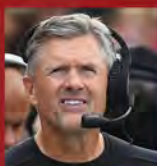
KYLE WHITTINGHAM 2008 UTAH