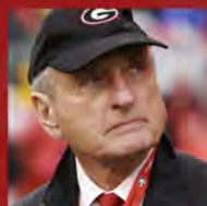
VINCE DOOLEY 2010