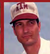
EUGENE STALLINGS 2004