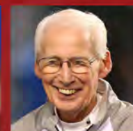
BILL SNYDER 2020