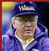
DON JAMES 1991 WASHINGTON