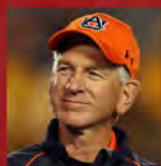
TOMMY TUBERVILLE 2004 AUBURN