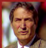
GENE STALLINGS 1992 ALABAMA