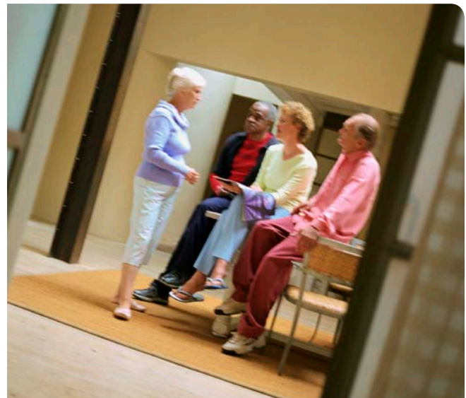
Sharing your feelings with friends or joining a support group may be a good way to ease the pressure you feel as a caregiver.

Provides resource referrals and information for caregivers and strives to be a voice for caregivers to the public and Capitol Hill. A newsletter and caregiving greeting cards are available to members. Provides free membership to caregivers.