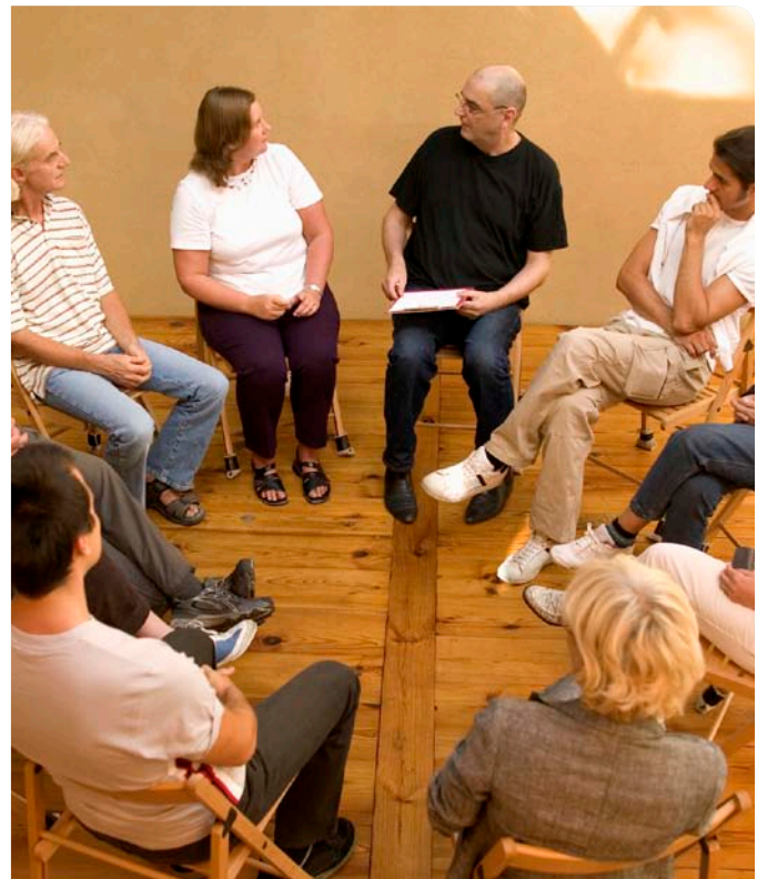
If you are suffering from depression, joining a support group may be an effective way to deal with your emotions.

Depression can often be treated with medication. If you need help dealing with your emotions, seek out a support group, counselor or physician. If you have thoughts of death or suicide, seek help immediately.