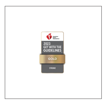
Use of color (other than what's specified in this standards document.)