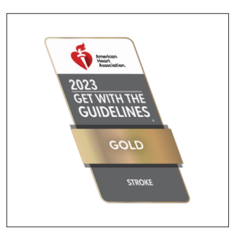
Rotate or skew