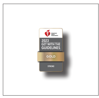
Use of special effects