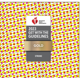
Background with pattern