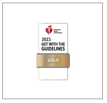
Use an icon as a pattern