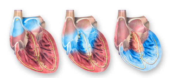
The illustrations above show normal conduction and contraction.

During AFib, some blood may not be pumped efficiently from the atria into the ventricles. Blood that's left behind can pool in the atria and form blood clots.