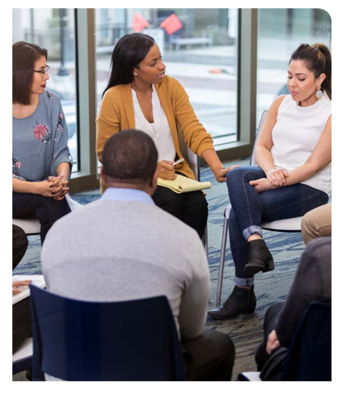
If you are suffering from caregiver burnout, joining a support group may be a good way to deal with your emotions.

Depression can often be treated with medication. If you need help dealing with your emotions, find a support group or counselor. If you have thoughts of death or suicide, seek help immediately.