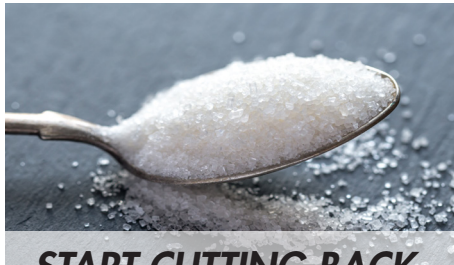
START CUTTING BACK.

Take steps to reduce or replace sugary drinks in your diet: