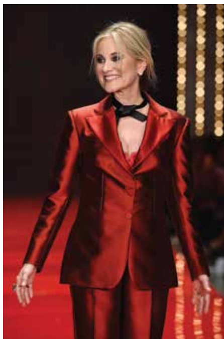
Actress Maureen McCormick in a satin pantsuit by Emilio Sosa, walked in honor of the late Florence Henderson, who played her mother on the iconic television show The Brady Bunch . “I go red for Florence Henderson (who died from heart failure) and to raise awareness in preventing congestive heart failure.”

Since 2014, the event has been hosted by the American Heart Association as the Go Red For Women Red Dress Collection with Macy's as the presenting sponsor. ■