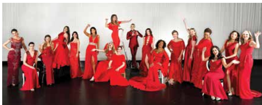
Celebrities and heart disease survivors turned the runway red when they showed off fiery fashions created by designers for the Go Red For Women Red Dress Collection. See page 4 for story.