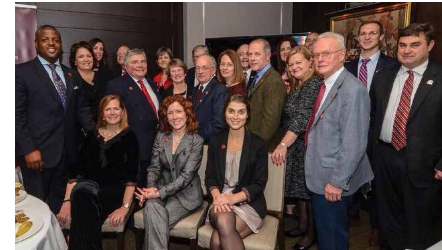
Local Cor Vitae Society members pose for a group photo.